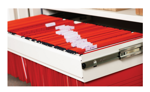
Suspended file frame, capacity: